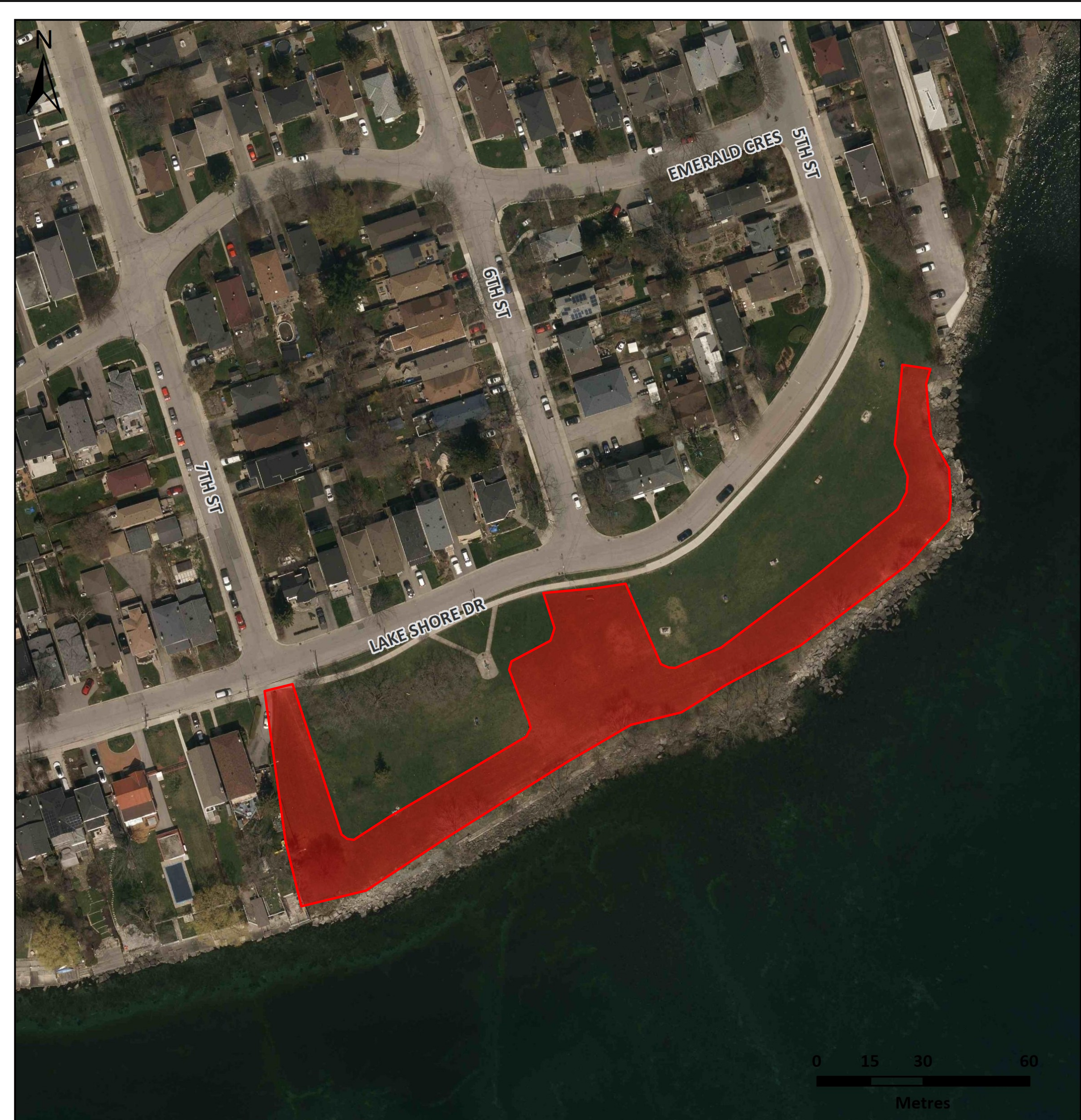
Cliff Lumsdon Park Revetment Major Maintenance Project 101 Lake Shore Dr, Etobicoke, ON M8V 2Z8