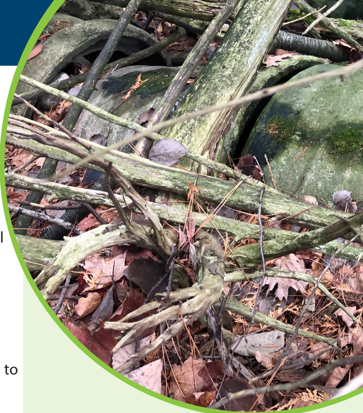
Separated concrete culvert at the dam.