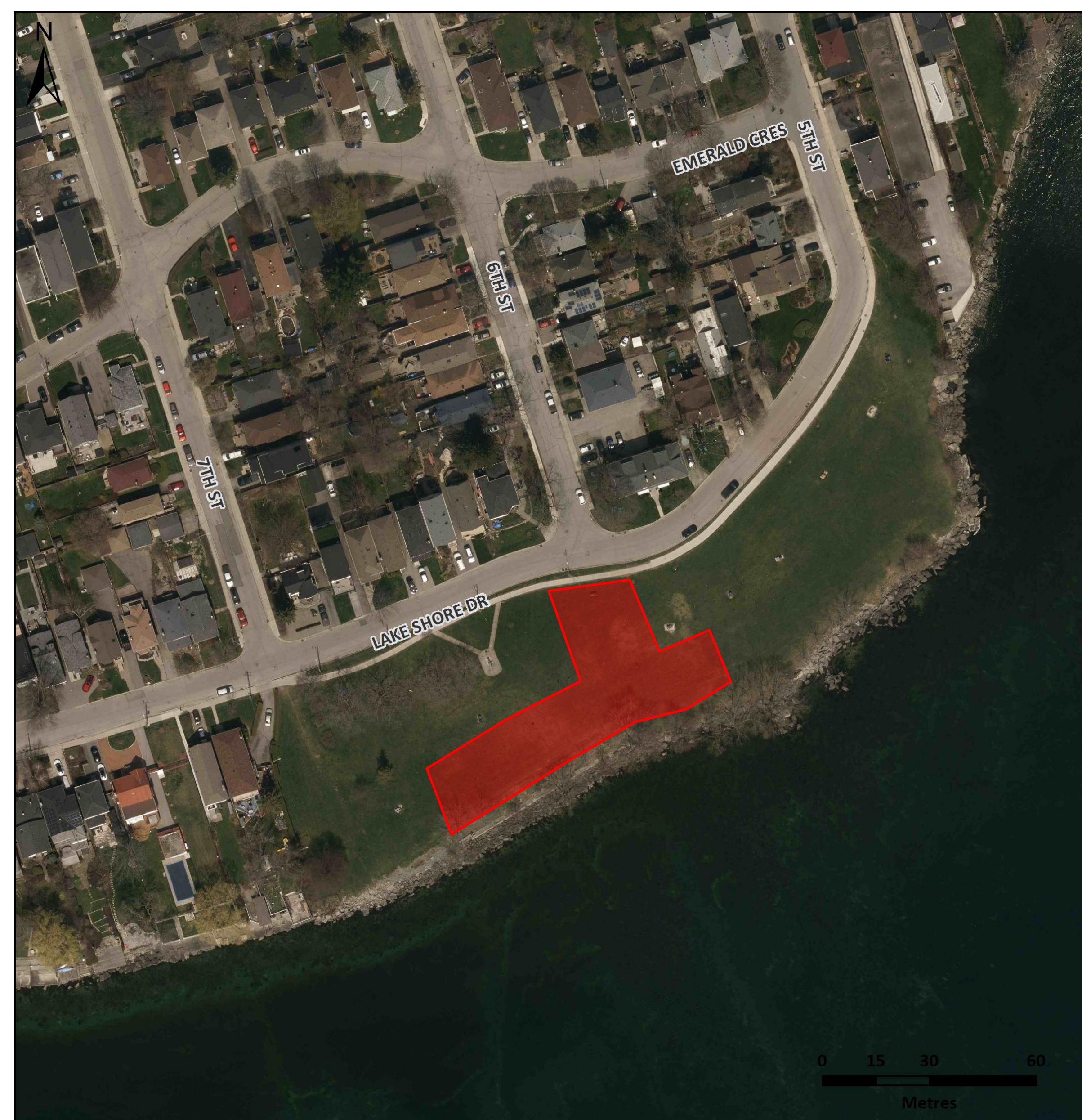
Cliff Lumsdon Park Revetment Major Maintenance Project 101 Lake Shore Dr, Etobicoke, ON M8V 2Z8