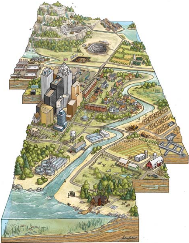
Cross section of a watershed.

A watershed is the area of land that catches rain and snow and drains or seeps into a marsh, stream, river, lake or groundwater. Watersheds are the collectors, filters, conveyers, and storage compartments of our fresh water supply.