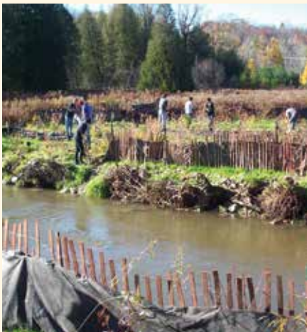
Greenwood stream bank bridge volunteers planting

TRCA worked closely with the Town of Ajax to improve Greenwood Conservation Area. This work was completed as part of the Atlantic Salmon Program, in partnership between TRCA and the Ontario Federation of Anglers and Hunters, to restore this section of stream bank to a natural condition.