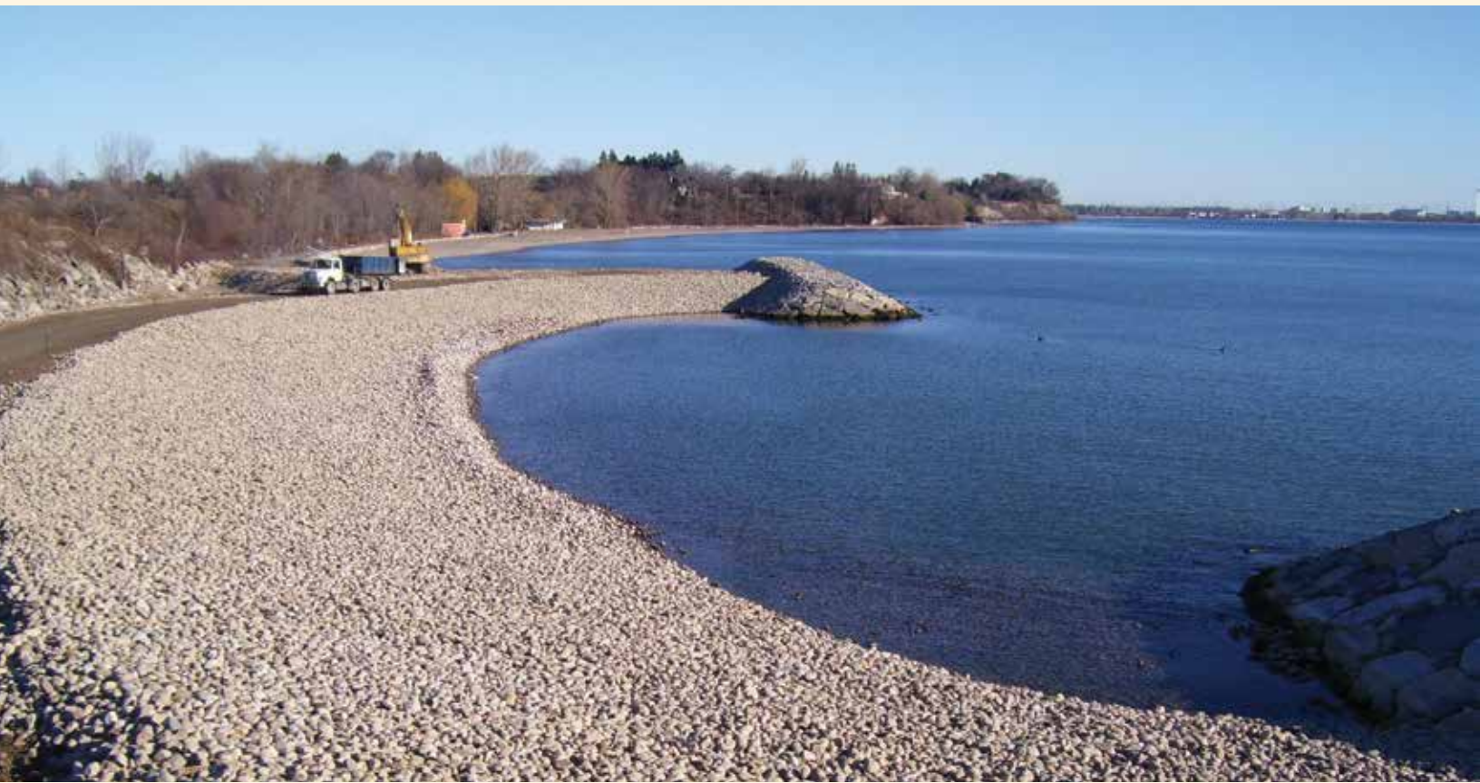
Port Union Waterfront Park - Phase 2