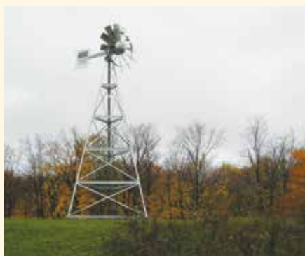
Glen Haffy aeration system

Albion Hills Community Farm — In 2010, the Albion Hills Community Farm, entered into a lease agreement with TRCA for 31 hectares (76.5 acres) at Albion Hills Conservation Area. This innovative project, located on the site of the former dairy farm, will include food production (i.e. vegetable and fruit crops, grains, lentils and much more), education and community gardens. The farm will work with the two adjacent outdoor education centres (TRCA and Toronto District School Board) as well as with partners from the agri-food sector, including the Palgrave Community Kitchen, Caledon Countryside Alliance, Eat Local Caledon and many others.