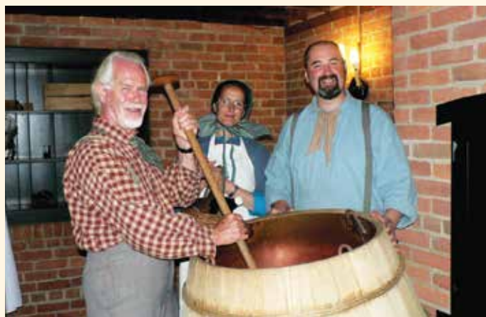
Black Creek Pioneer Village Brew Master Workshop, 2010