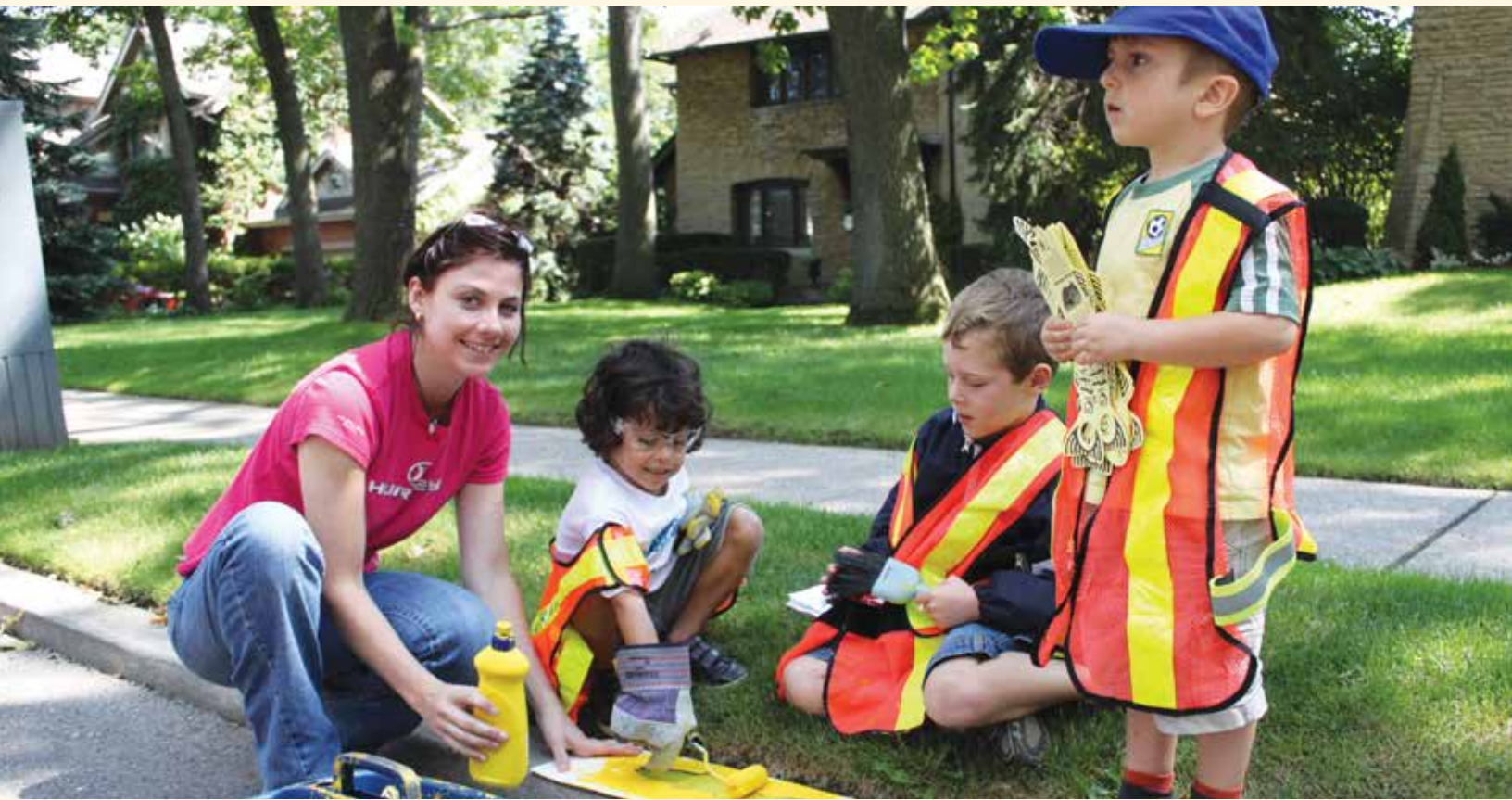
Students taking part in Yellow Fish Program