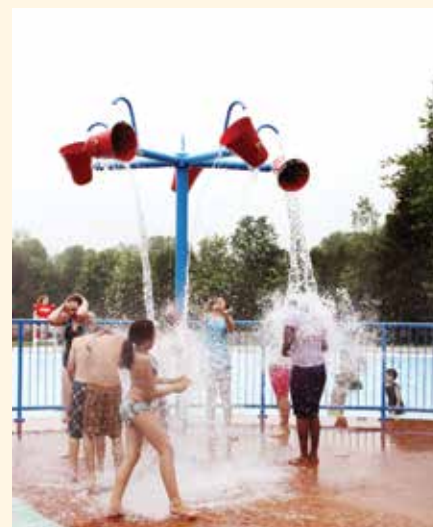
Lakeview Splash opening

The Lakeview Splash water play facility opened at Albion Hills in 2010. It features a 440 square metre wading pool (4 ft. deep) and a 125 square metre interactive splash pad. Kids of all ages can enjoy clean and safe water fun. Sustainability features include a closed loop water recycling system with state-of-the-art filtration and sanitation system. The water recycling system uses water from the aquatic playground elements by collecting it in drains located on the floor of the playground. It is then pumped back into the pump house where it is filtered through sand filters, sanitized by a UV system, and pumped by a 15 hp circulation pump back through the system to be used again. Treated water passes through sensors which ensure water going to the spray features is clean. If the makeup of water passing through the sensors is not within the allowable limits, the system shuts down, thus ensuring the quality of water being used.