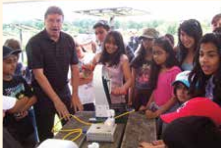
HSBC Bank Canada supports Power Trip Trail

2010 was an excellent year at The Living City® Campus at Kortright for forging new partnerships and launching innovative demonstrations, exhibits and programs. In 2010, the campus offered the collaborative Sustainable Energy Initiative with York University and Centennial College, provided renewable energy training for Seneca College's distance learning program, and partnered in providing solar hot water workshops with the Canadian Solar Industries Association. The Living City® Campus at Kortright also provided private company training for Canadian Solar Solutions Inc., Green Edge Products, Sentinel Solar Corp. and the Canadian Union of Skilled Workers.