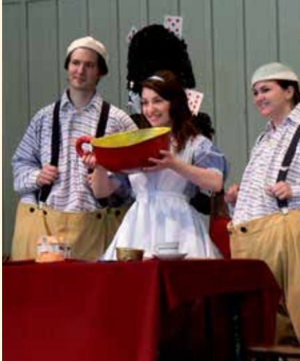
Alice In Wonderland activities at Black Creek Pioneer Village

Exhibits to augment visitor experience included a 50-year retrospective photo exhibit, a major exhibit of toys from the BCPV collection, and smaller temporary exhibits from our collections and from members and collectors in our community.