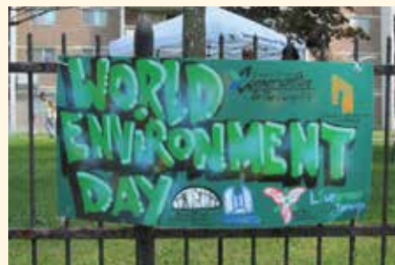
Black Creek SNAP

The Metcalf Foundation awarded the Black Creek SNAP a two-year $140,000 grant to support social marketing research, community engagement and demonstration projects.