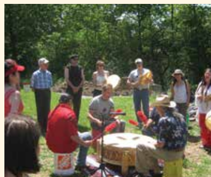
Heart Lake Medicine Wheel Garden opening

An archaeological excavation was completed in the backyards of five neighbouring houses in Scarborough during the summer of 2010. TRCA archaeologists identified three sites during an archeological assessment completed on private residential properties backing onto the Rouge River Valley in advance of extensive stabilization measures. These