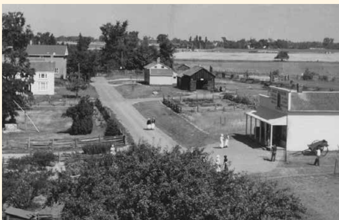
Black Creek Pioneer Village, 1963