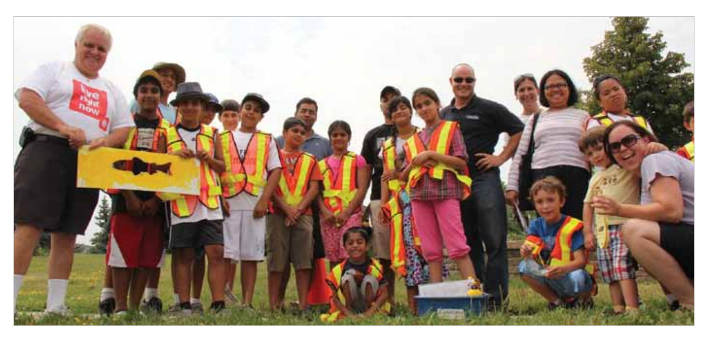
Engaging local children through educational workshops

Population: 5,800 (1,600 households) Immigrants: 55% (majority pre-1991) Median age: 37 Language: English (45%), Punjabi (22%) Median household income: $77,008 Employed outside of Brampton: 28.8% Dwellings: 84% owned, 16% rented Building age: 1983-1987