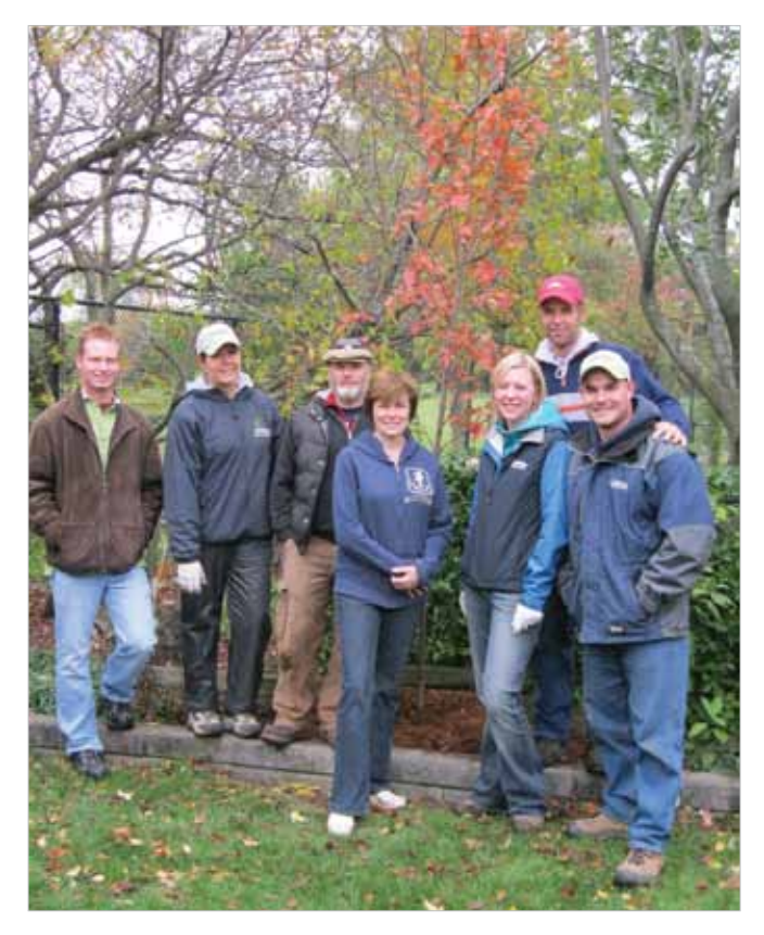
Residential tree planting initiative Oct 2011

Specific habitat restoration projects include large patches of naturalization planting and tree establishment in County Court Park, Havelock Park, and the Peel Village and Brampton Golf Courses to enhance natural vegetated connections and support the natural features of the Etobicoke Creek system. In partnership with the golf courses, restoration along the Etobicoke Creek and Tributary 2 will include bank stabilization, erosion protection, wetland and water storage, barrier removal, infill planting and no-mow buffers. There are also significant enhancement opportunities as part of the Upper Nine SWM pond retrofit including plantings across numerous moisture zones, from deep water to upland areas. The retrofit opportunities for the Upper Nine SWM Pond will also include the construction of a treatment wetland to complement the pond functions, and enhance the local vegetation communities and wildlife habitat. Working collaboratively with 407 ETR, infill planting in the nearby highway corridor will also improve natural cover quality.