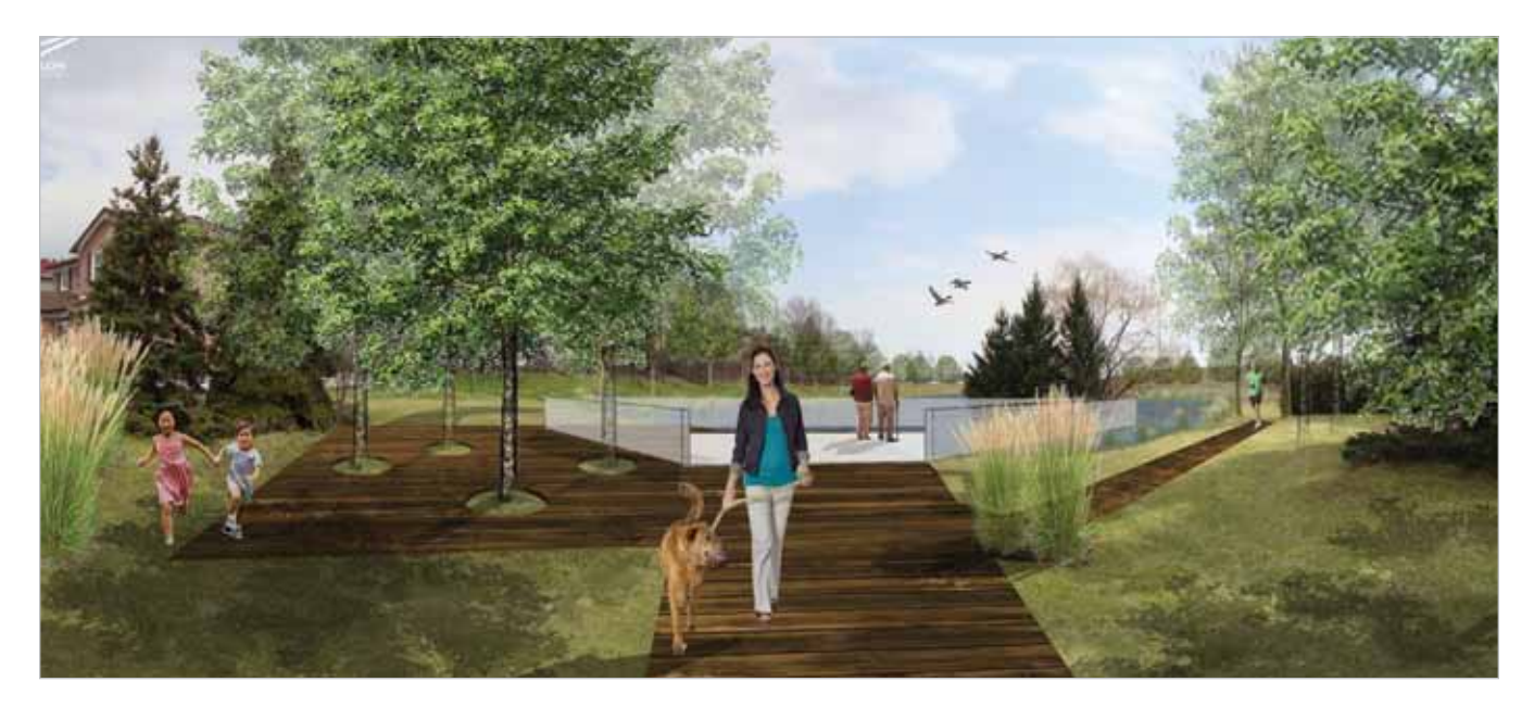
Proposed neighbourhood perspective at the pond (Dillon Consulting)

passive recreation destination within a beautiful parklike tree setting. This includes a community entrance, a boardwalk with meeting area, lookouts to the natural landscape and pond, and interpretive signage that draws on historical and cultural themes of the area, and describes the pond functions. The SNAP project has followed the Environmental Assessment (EA) protocol for stormwater pond retrofits, and the SNAP concept can now inform the future detailed design for the retrofit to be undertaken by City of Brampton.