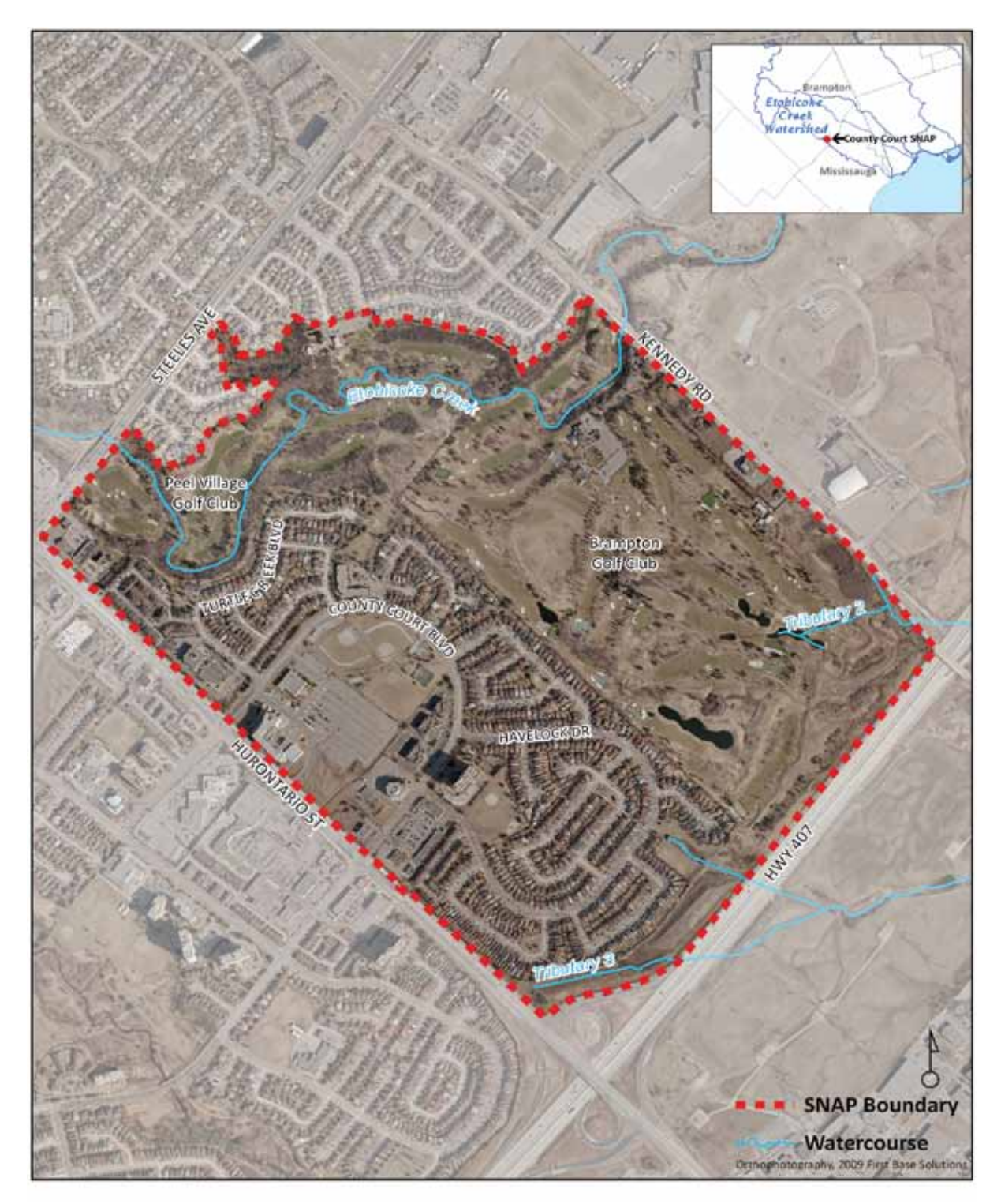
Figure 1: County Court SNAP neighbourhood, City of Brampton, Region of Peel, Ontario