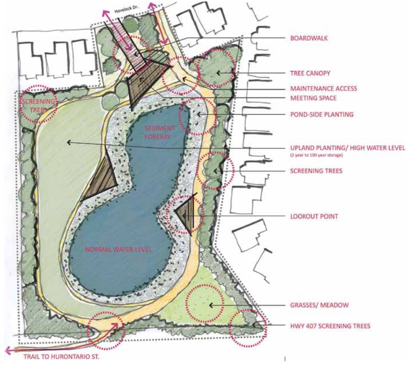
Upper Nine SWM concept design

partner and resident input, a retrofit concept has been developed that transforms the existing fenced-in dry pond to a neighbourhood amenity that achieves the required technical stormwater functions, while providing accessible public space to County Court residents. At the same time, the pond retrofit is supported by other upstream stormwater management measures, including bioretention throughout the pond's catchment and rainwater harvesting for use in golf course irrigation which supports improved stormwater quality, reduced flows, erosion control and overall water balance.